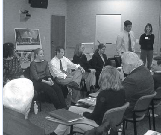
LSL class members share their observations with teachers from the Teach for America program after shadowing 31 teachers in 14 schools.