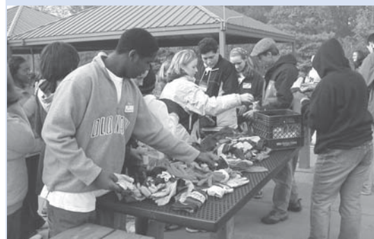
Youth Leadership St. Louis participants gather equipment to start their service project at Queeny Park. The students cleared two fields of overgrown honeysuckle that was killing the underlying plants.